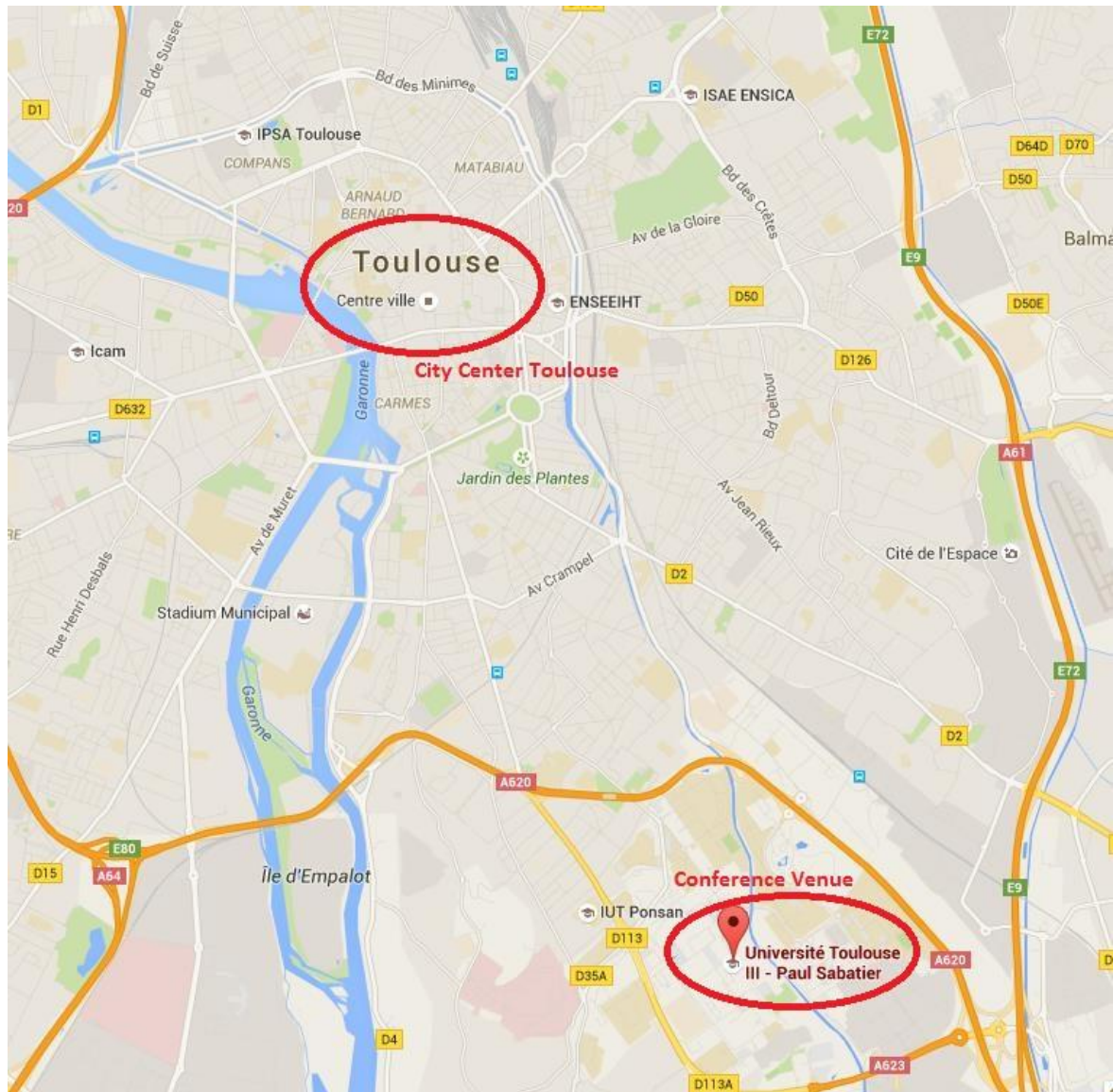
Map 1: Venue Overview