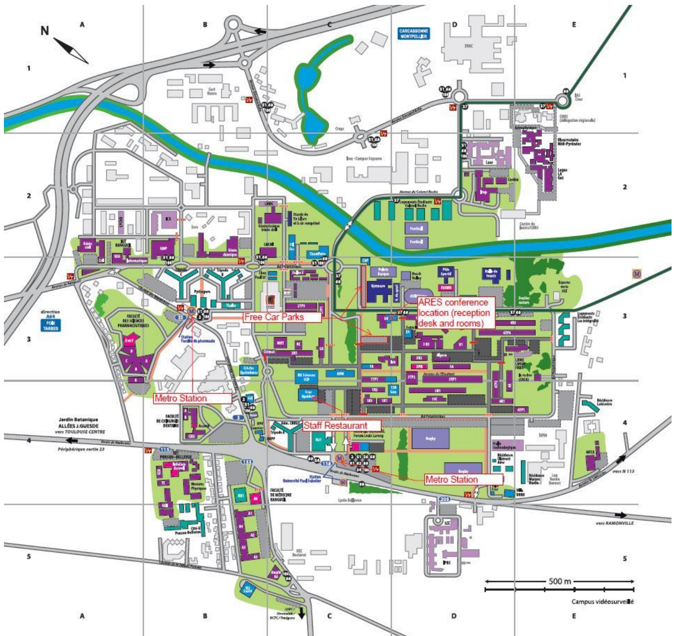
Map 2: Conference Venue Map

The Conference Venue (Université Paul Sabatier) is located along underground line "Métro ligne B", stop "Université Paul Sabatier". There are also free car parking spaces available.